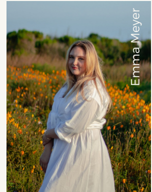
VP RECRUITMENT INTERNAL