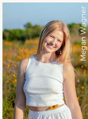
VP RECRUITMENT EXTERNAL